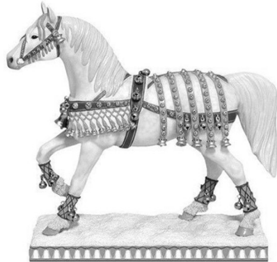
Holy Horse Bells! Zechariah 14:20