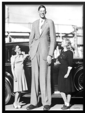
Robert Wadlow 8' 11"

Average height of a pro basketball player is 6' 6"