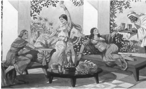
The Women of Samaria “Cows of Bashan”

Isaiah 3:12 —“O my people! Their oppressors are children, and women rule over them. O my people! Those who guide you lead you astray and confuse the direction of your paths.”