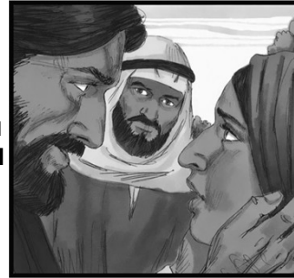
Martha John 11

Who was the first person to see the Lord Jesus after His resurrection?