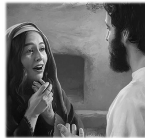
Mary Magdalene John 20

Who was the first person to see the Lord Jesus after His resurrection?