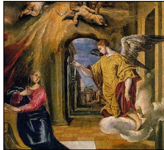
"The Annunciation" by El Greco (1570-1575)

Gabriel brought the message of Christ's birth to Mary. Luke 1:26-38