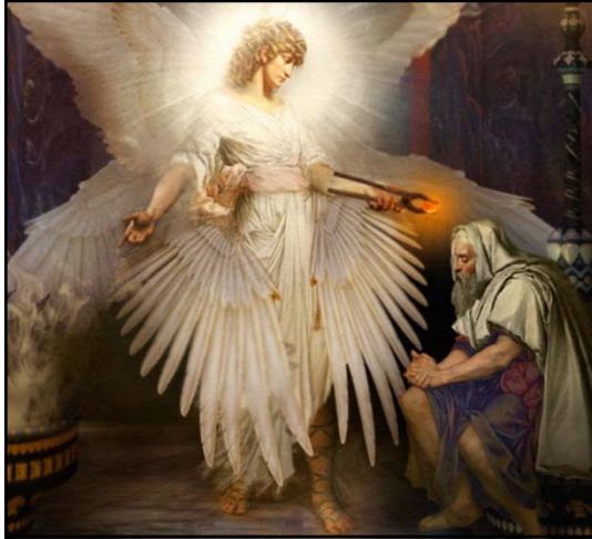
Isaiah's vision Isaiah 6:1-13